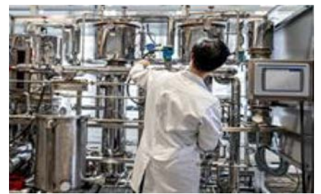
Industrial Product Development & Engineering

To accommodate our customers in highly demanding sectors, we take into consideration the fact that some technologies must be durable and highly resistant to unforgiving conditions such as corrosion, vibration, shock and variable temperatures.