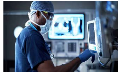
Medical Research & Life Sciences