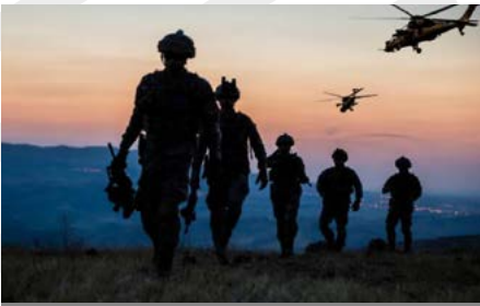
Military & Defence