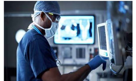
Medical Research & Life Sciences